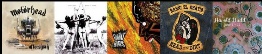
left to right: Motorhead, Bardo Pond, Burnt Books, Hanni El-Khatib, Harold Budd