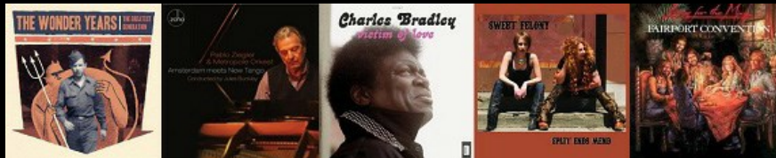
left to right: Wonder Years, Pablo Ziegler, Charles Bradley, Sweet Felony, Fairport Convention