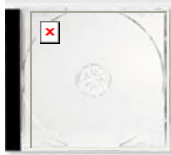
Jandek Interstellar Discussion